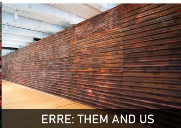
ERRE: THEM AND US