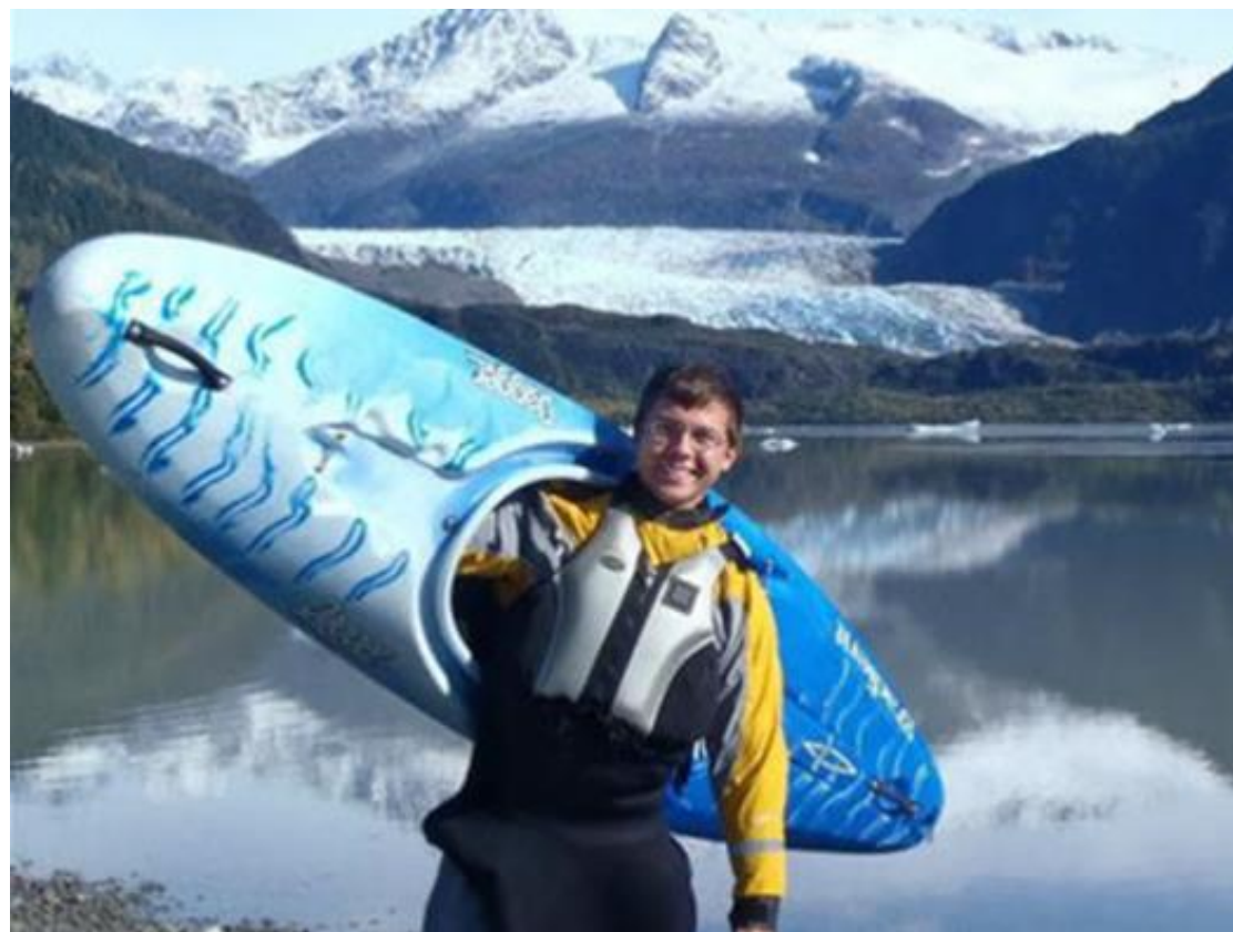
Kayaking in Alaska

Tuition and fees paid to MCLA; room and board to the host institution.