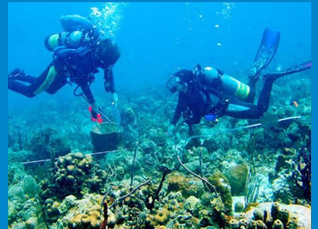
Researching reef ecology in the Virgin Islands