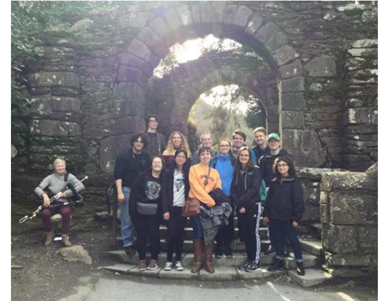
Ireland travel course 2019

China Colombia England Ireland Japan Mexico South Africa Spain