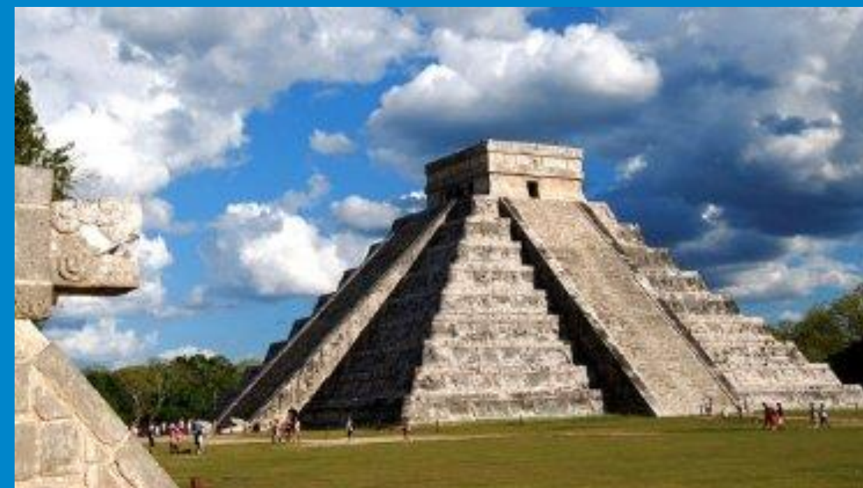
Mexico travel course 2019